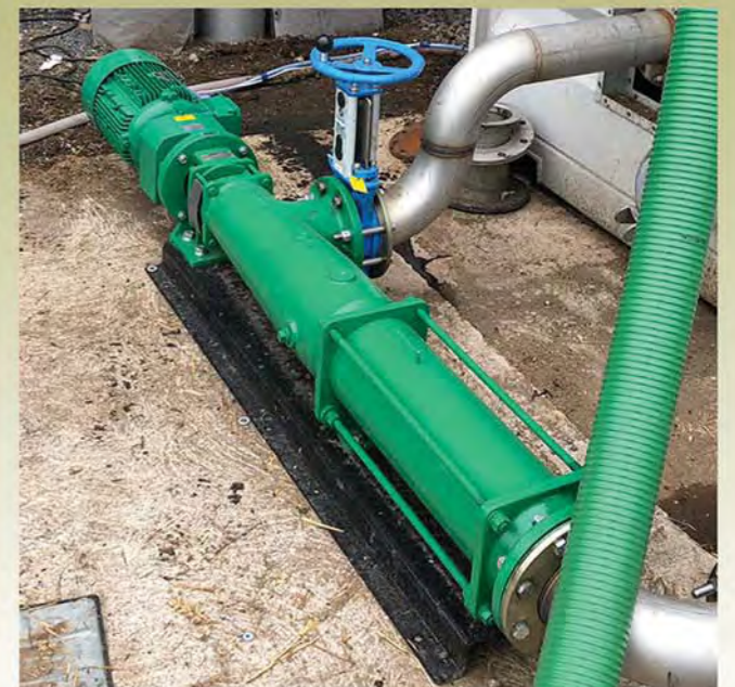
BIOMASS TRANSFER PUMP Flow – 40 m 3 /hr, Pressure – 3 bar