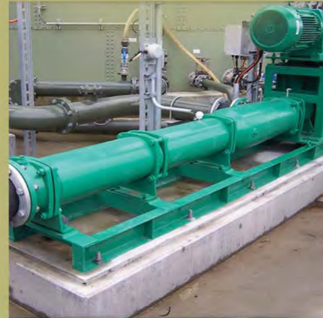
DIGESTATE TRANSFER PUMP Flow – 75 m 3 /hr, Pressure – 10 bar