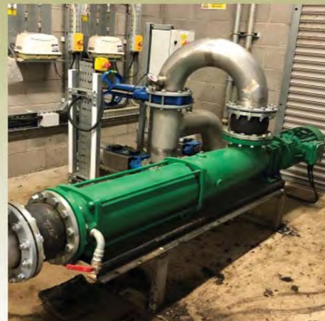
BIOMASS RECIRCULATION PUMP Flow – 80 m 3 /hr, Pressure – 4 bar