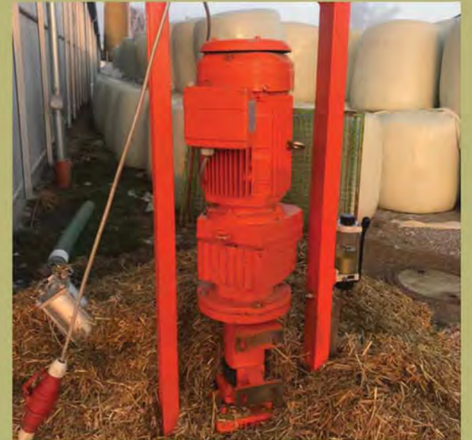
LIQUID MANURE PUMP Flow – 40 m 3 /hr, Pressure – 4.5 bar