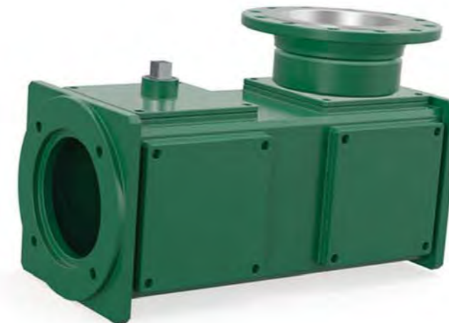
6 Opening Pump Housing