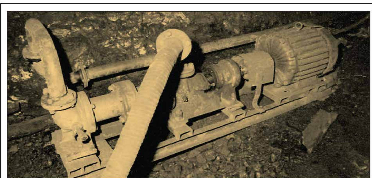
Roto original MR series pump in use