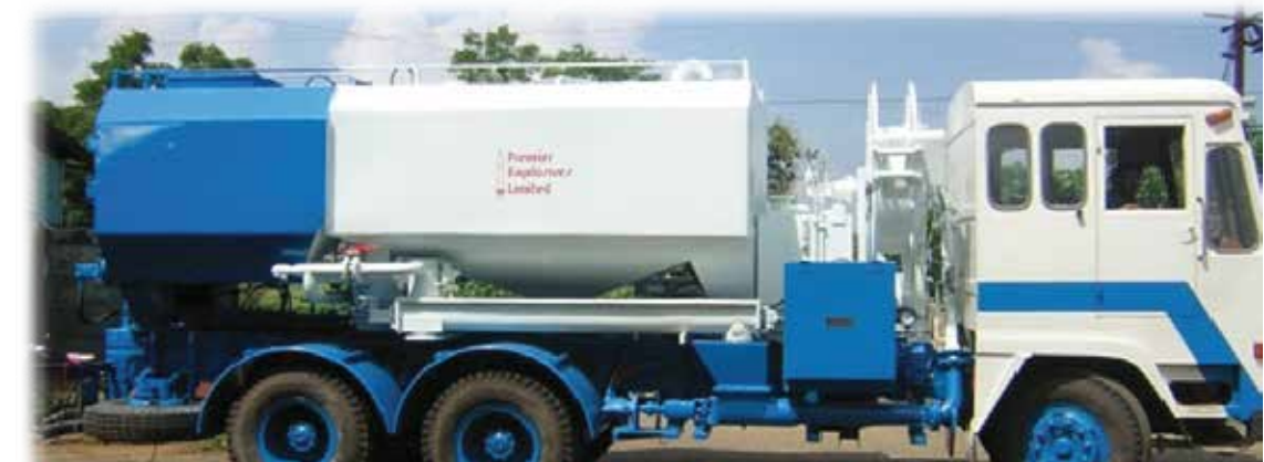
Roto Wide Throat Pump Mounted on SMS Truck